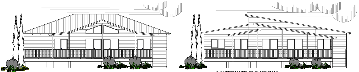
* ALTERNATE ELEVATION *